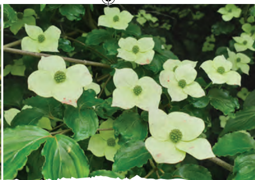
Cornus kousa var. chinensis Kousa dogwood (Ernest Wilson)