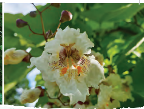
Catalpa bignonioides "Aurea" Indian Bean tree