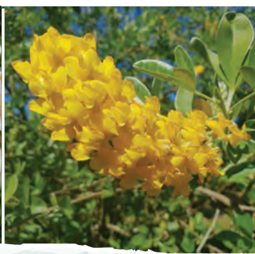
Cytisus battandierii Pineapple broom