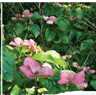
Cornus kousa 'Miss Satomi' Pink flowering dogwood