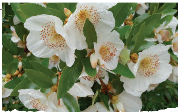
Eucryphia nymansinensis "Nymansay" Nyman's hybrid